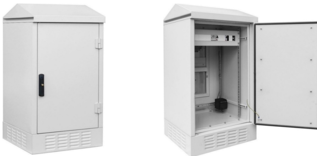
SZK-18U z klimatyzatorem